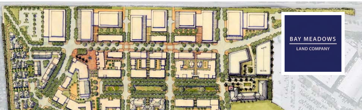
Lastest Plans for Bay Meadows Development | artist rendering