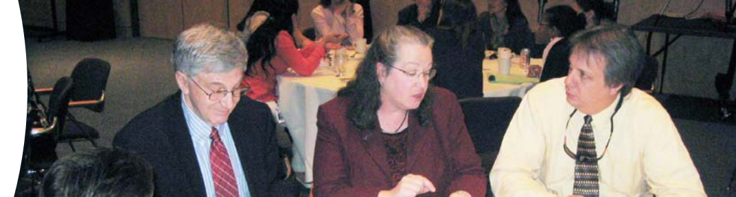
Competitive Global Workforce Conference