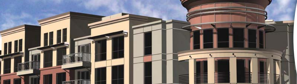
Grand Boulevard | San Bruno, 3-D View from El Camino Real | artist rendering