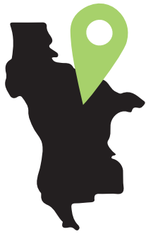
San Mateo County